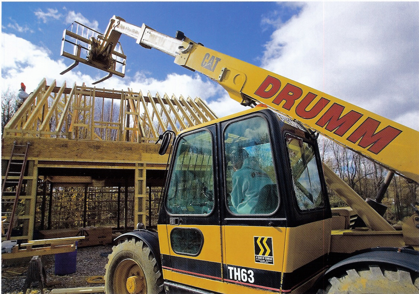
In the process of building a carriage house, a Drumm-owned rough terrain forklift is at work.