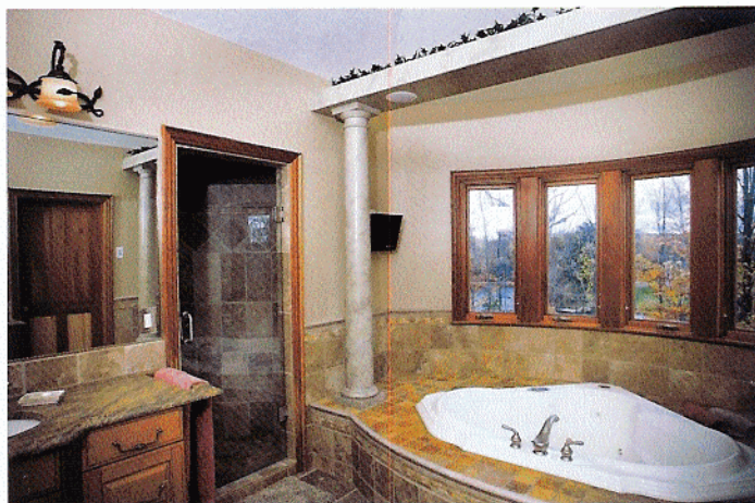
This spacious master bath centers around the hot tub, which is surrounded by a tumbled marble finish, columns and curved windows on a curved wall. To the left is a glass door leading to a steam shower. The added beauty of this room is the view overlooking the lake and the colors of the season.