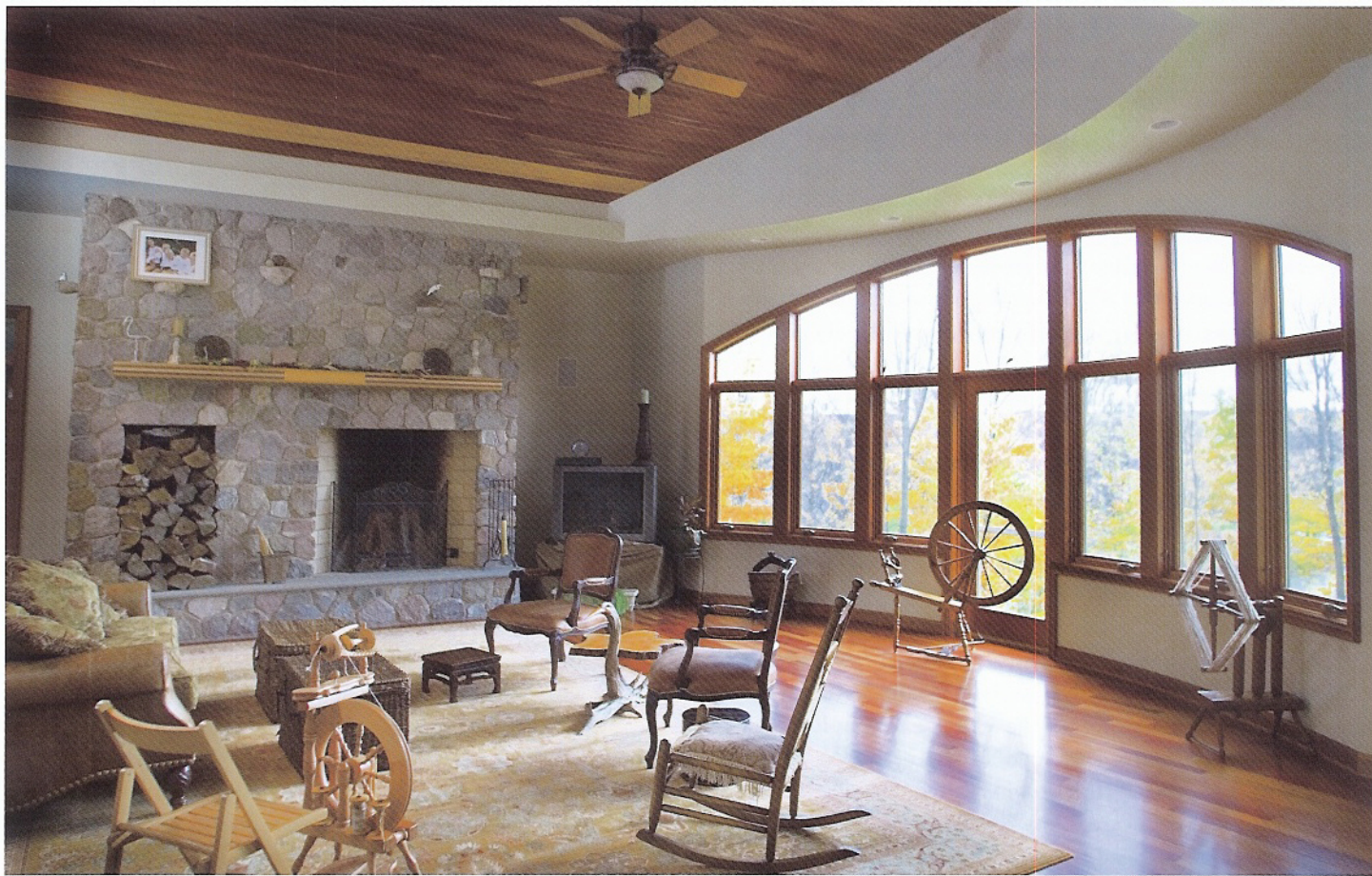
The great room in this home offers an authentic Rumsford fireplace with a full wall of arched windows on an arched wall. This room also provides the right finishing touches with its barrel vaulted ceiling, cherry trim and Brazilian cherry hardwood floors. And, the simple furnishings of spinning wheels and yarn winders offer the perfect décor to complete an Old World charm.

commercial buildings a year. His average home has a price range of $800,000 with an average size of 5,500 square feet. Mark was quick to point out though, "That regardless of the size or the value of the project, quality will never take a back seat. We always do our own carpentry, framing, trim work, etc., which gives me control of the finer details," he said.