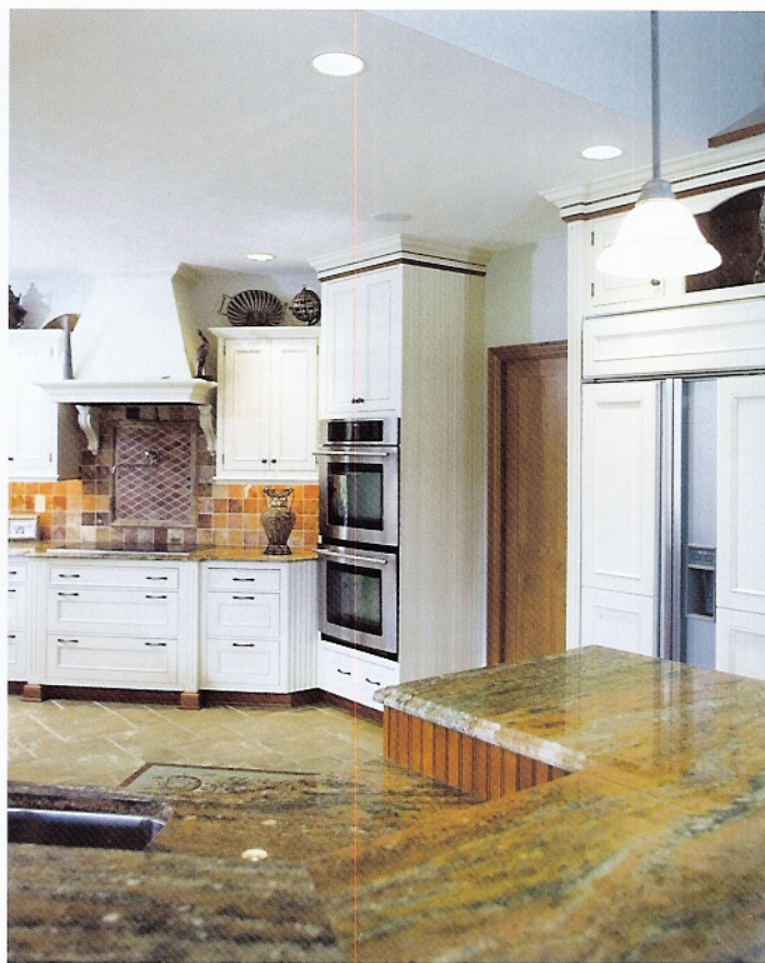
This lovely open kitchen features light colored Wood-Mode cabinets with under-cabinet lighting highlighting the granite countertops and tile floors.