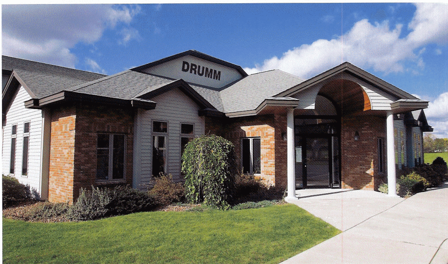
A commercial building featuring some of the unique design and construction capabilities of Drumm Construction, such as cut-up roof lines and barrel vaulted entry ways with columns.

You may contact Mark Drumm at 315-696-5756. ■