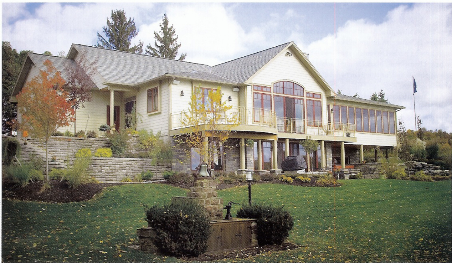
This transitional-style home on Otisco Lake is strategically placed to fit into the grade of the land. The home features a sunroom on the main level and a walk-out basement to a stone patio with a hot tub for that picture perfect view of the lake and the surrounding shoreline.